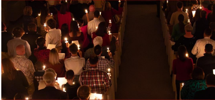
Christmas Eve Candlelight Services Tuesday, December 24 at 5:00 pm and 11:00 pm in the Sanctuary. Join us as we celebrate the birth of Jesus with worship and The Friendly Beast (5 pm only).