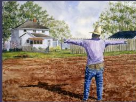
EXHIBIT DATES: SEPT. 5 - OCT. 24